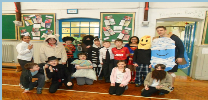
The children have had a fantastic week.