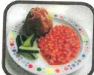
Jacket Potato with Bacon and Beans