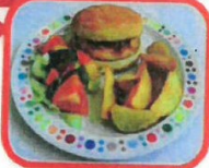
Organic Beef Grill (G.) in a Bun (S.G.)