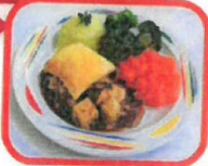
Chicken Pie (D.G.)