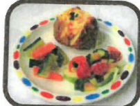
(v) Jacket Potato with Cheesy Coleslaw (D.E.M.)