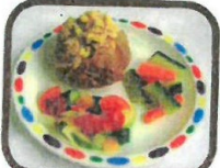
Jacket Potato with Tuna and Sweetcorn (D.E.M.F.)