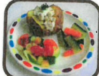
Jacket Potato with Chicken Mayo. (SU.D.E.M.)