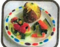
(v) Jacket Potato with Cheese (D)