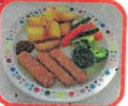
Gluten Free Salmon Fillet Fingers (F.)