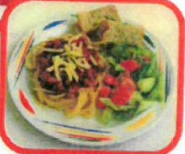
Spaghetti Bolognese (D.G.)