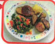
Roast Pork or Gammon Joint