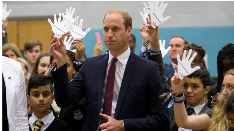
Prince William gives a High 5 supporting the anti bullying campaign.