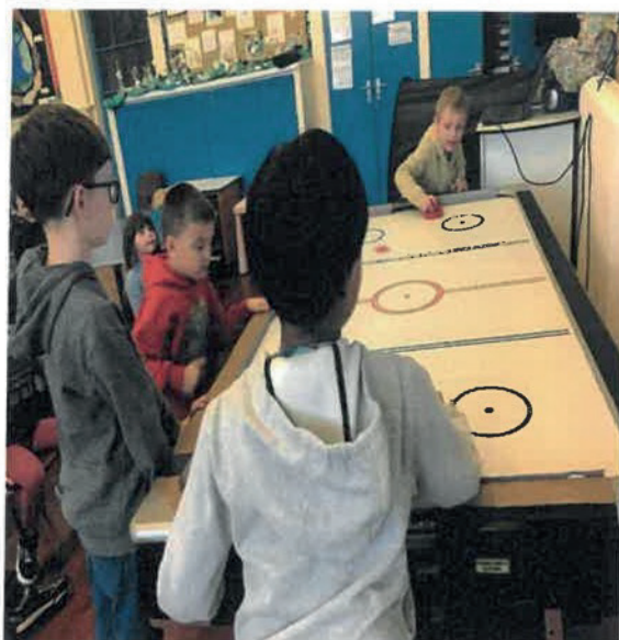
Enjoying air hockey