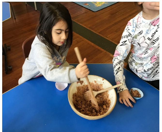
Making Easter nests!